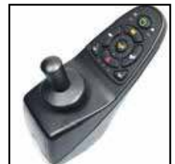
Dynamic Shark Controller