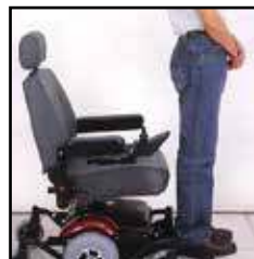
Excellent stability on footplate