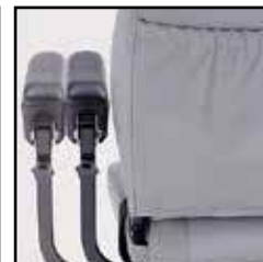
Width adjustable armrest