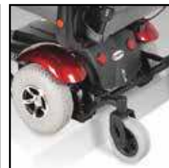
True six wheel design