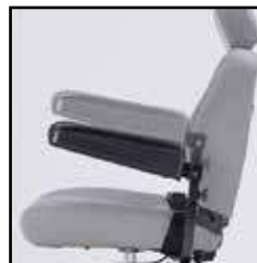
Height adjustable armrest