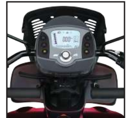
Digital LCD Dashboard Display.