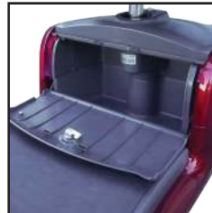
Lockable storage drawer underneath the seat.