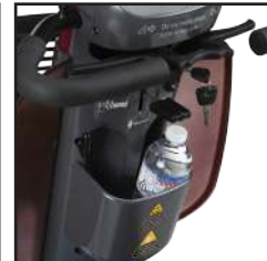
Extra storage & Shopping bag hook.