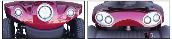
LED lighting system.