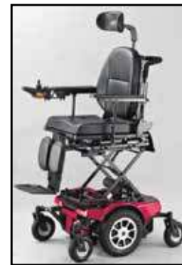
Seat elevator travel range: 30cm/12inch