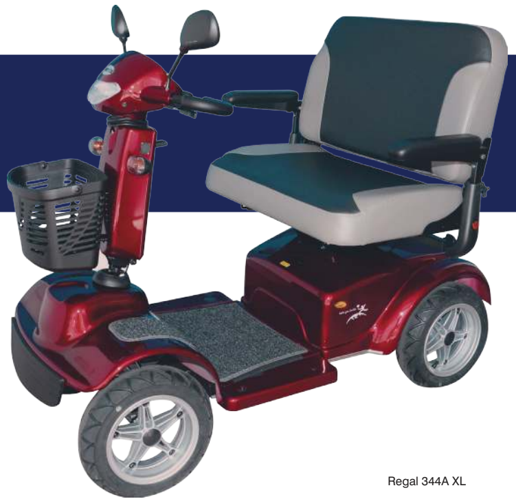
Regal 344A XL